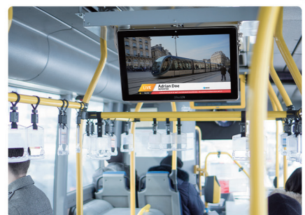
Digital signage (transportation)