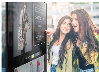
Digital signage (shopping mall)