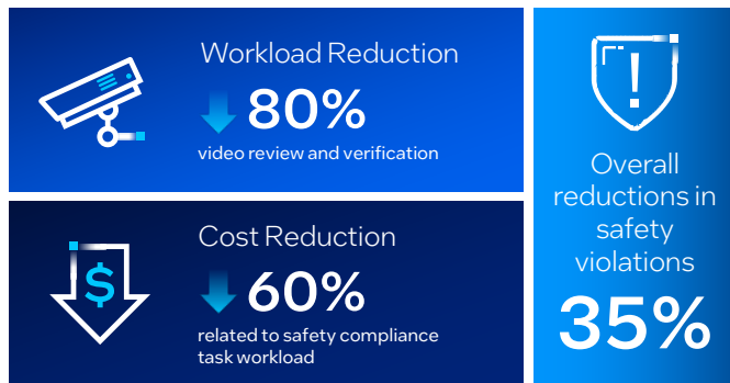
Figure 2. The bottling company reduced manual workloads by 80 percent and reduced the costs related to HSE compliance by 60 percent. Overall safety violations were reduced by 35 percent. 3

Almost overnight, the bottling company witnessed enormous benefits that totally altered how it approached monitoring and inspection. It had an advanced solution in place that accommodated today's complex and highly automated requirements.