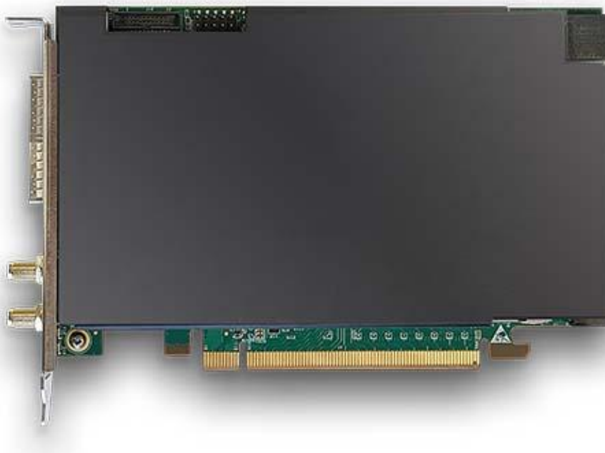
N6010 by Silicom.