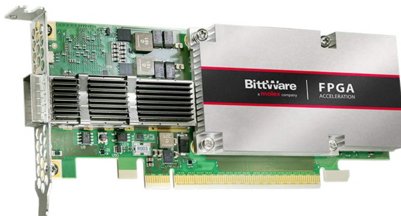
IA-420F by BittWare.