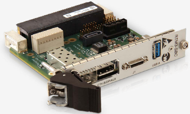
Figure 2: RTM3-SBC rear transition module